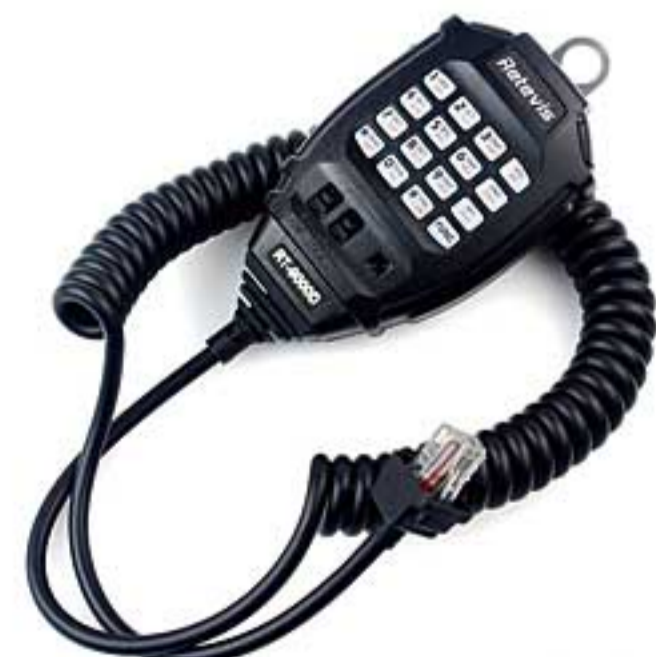
Handheld Speaker Mic